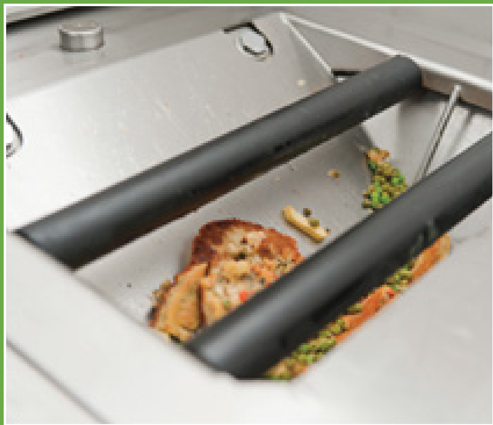
Magnet to catch metal parts