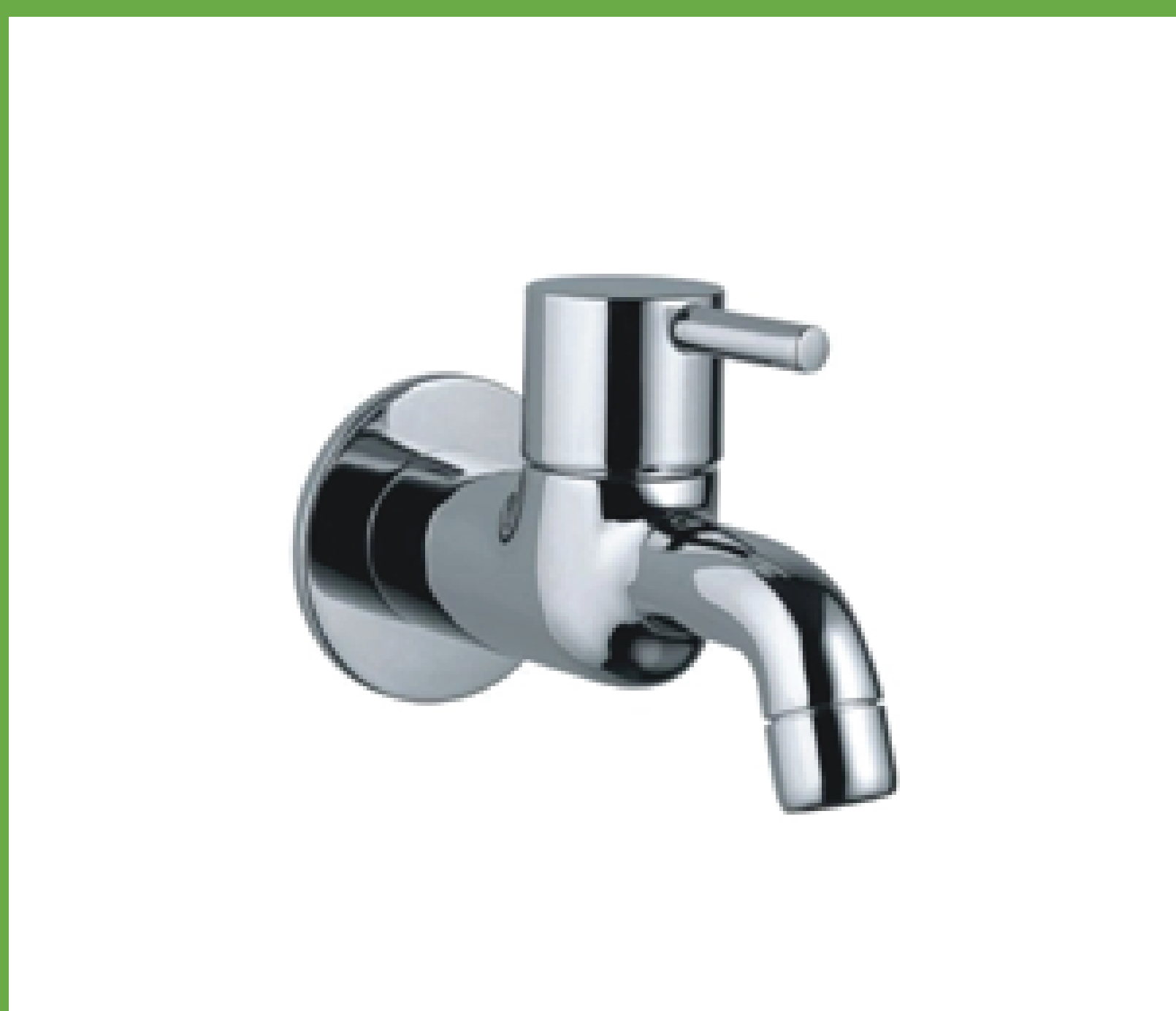
Input tap for water- hot and cold