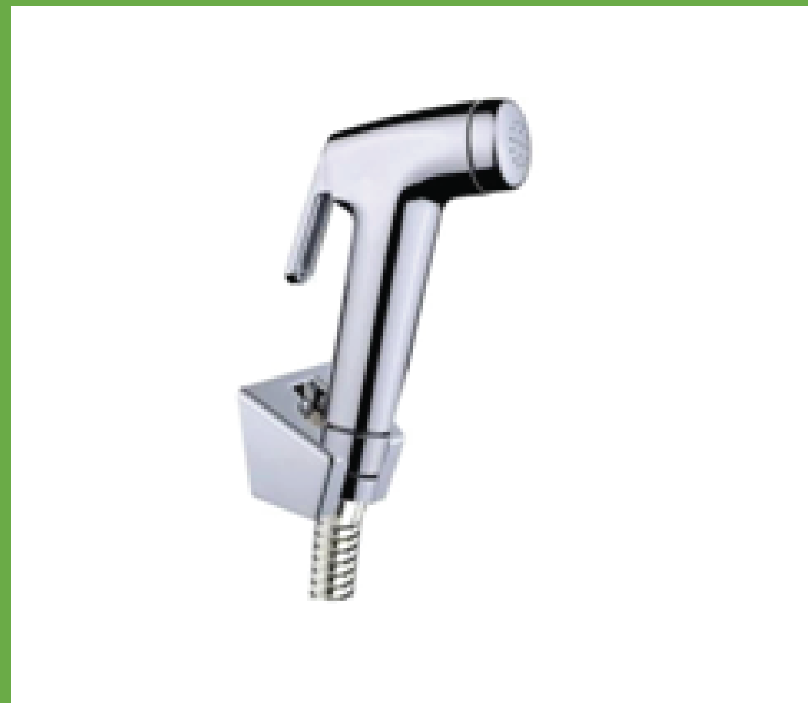
Spray jet to clean the top & external walls