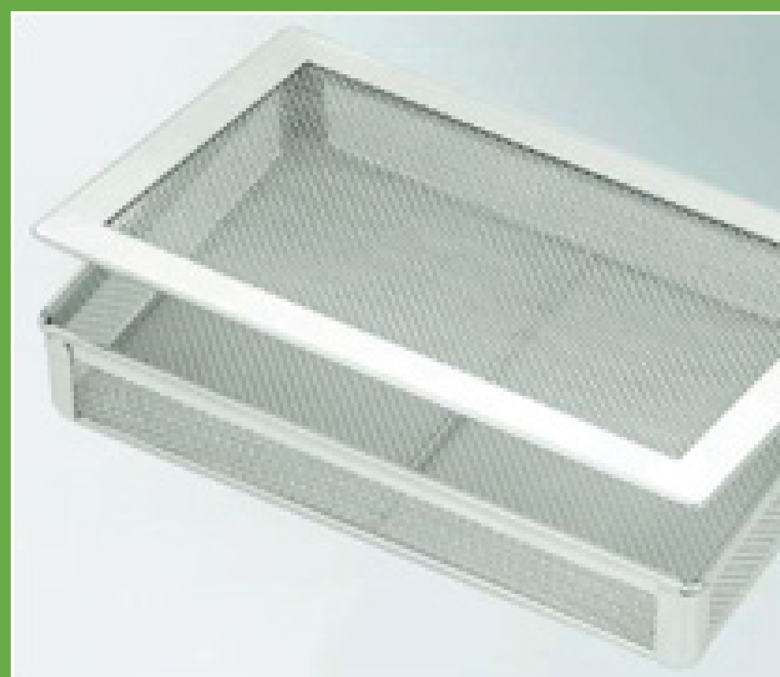
Mesh lid to prevent rodents & insects

The WasteXpert Dewaterer is a perfect food waste handling solution for anyone who believes in savings and efficiency. The Dewaterer is ideal for establishments like: